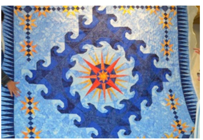
Close up of the raffle quilt for this year.