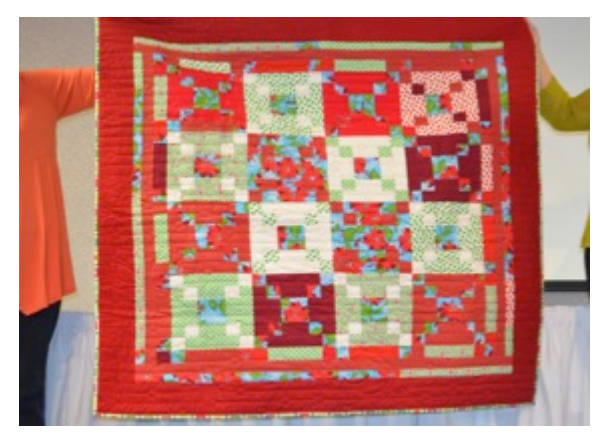
Gail Bronner's modern Christmas quilt