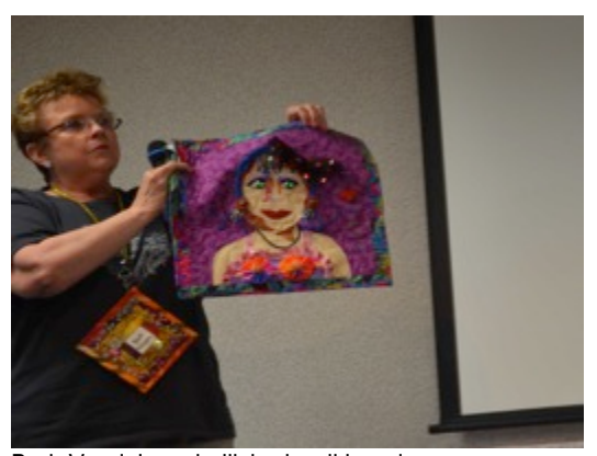
Barb Vergin's embellished wall hanging.