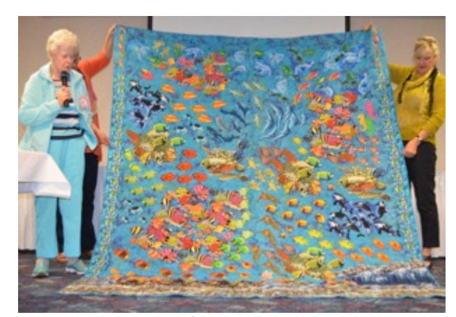
Pat Twaits' hand colored fish quilt.