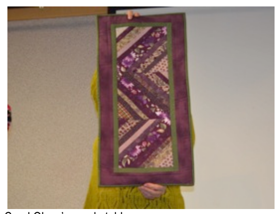
Carol Olson's purple table runner.