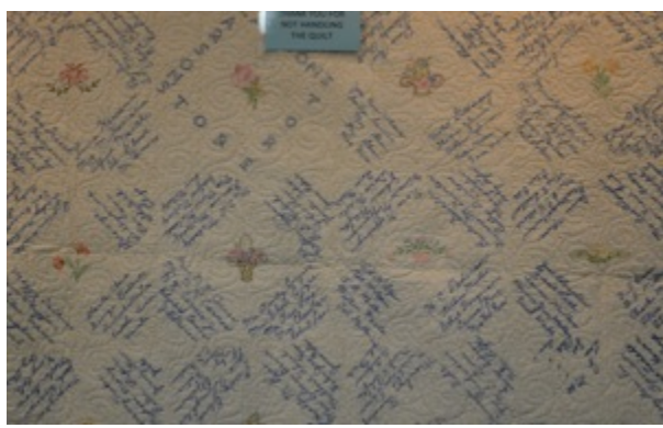
Close up of the "Tenney" Quilt