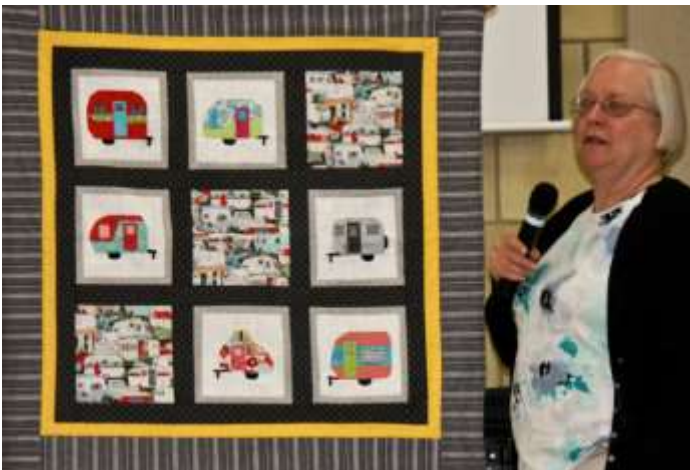
Suzanne Nelson Mobile Camper Table Cloth