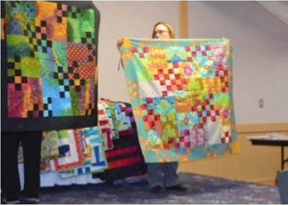
An example of using same pattern and different fabrics.