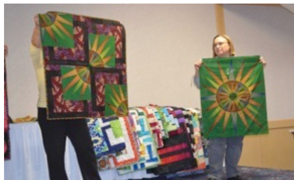
An example of cutting a panel to create a different effect