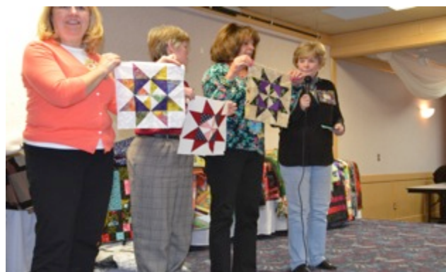
B. O. M. for October