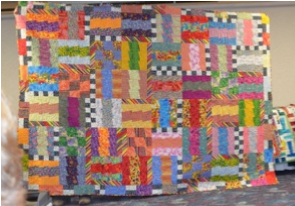
An example of using a focus fabric in all blocks for continuity.