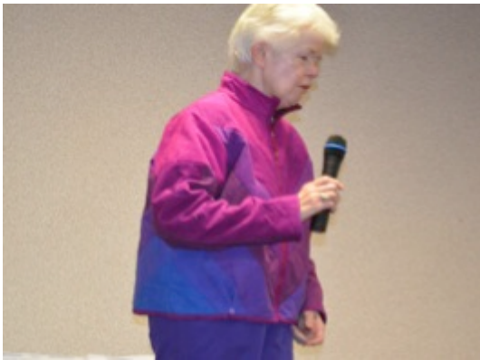
Pat Twait's jacket from Cherrywood Fabrics