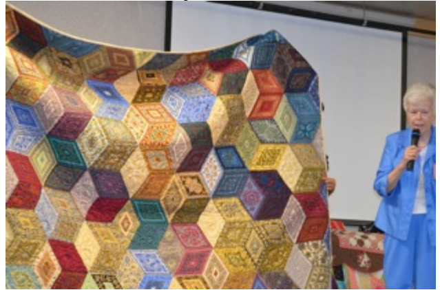
Pat Twaits' "Tumbling Blocks" made with border fabrics.