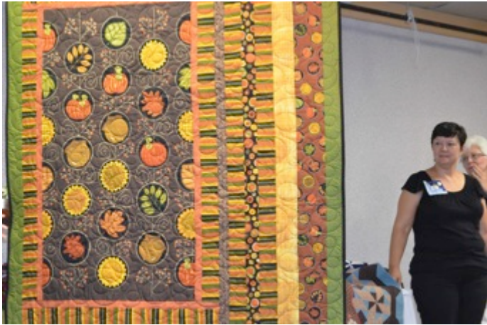
Edith Lejonvarn's modern quilt in fall colors.