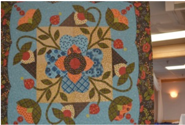
Kari's "Breezy" pattern