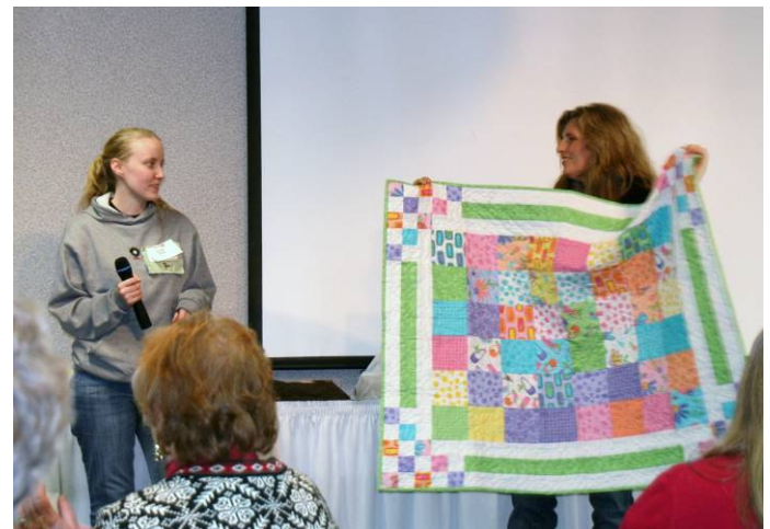
One of our youngest members proudly shows her newest creation during Show and Share.