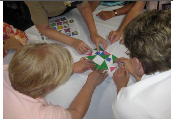
Above: members trying to correctly assemble the colored geometric pieces against a time clock. Below: winners row!